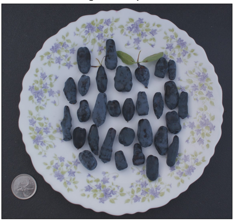
Haskap berries or blue honeysuckles showing the diversity of shapes and sizes.

In the wild, Haskaps are found in northern Borel regions of the globe, most especially in places like Russia,